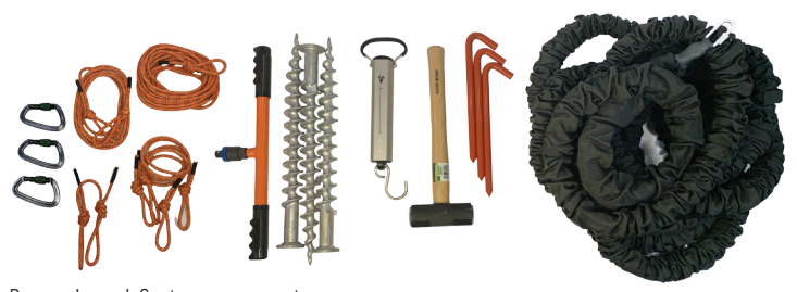
Bungee Launch System components