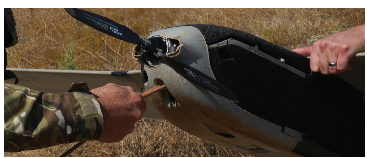
Puma LE mounting bracket