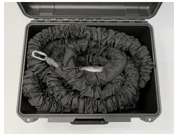
Bungee Adapter for Puma 2 AE and Puma 3 AE