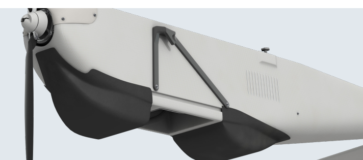
Puma 2 AE and Puma 3 AE mounting bracket