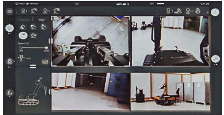
High-resolution multi-touch screen—multiple camera view options