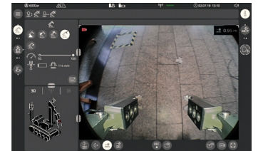
Real-time 3D avatar modeling—touch to access manipulator or camera feed